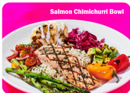
Salmon Chimichurri Bowl