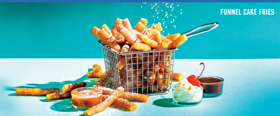
FUNNEL CAKE FRIES