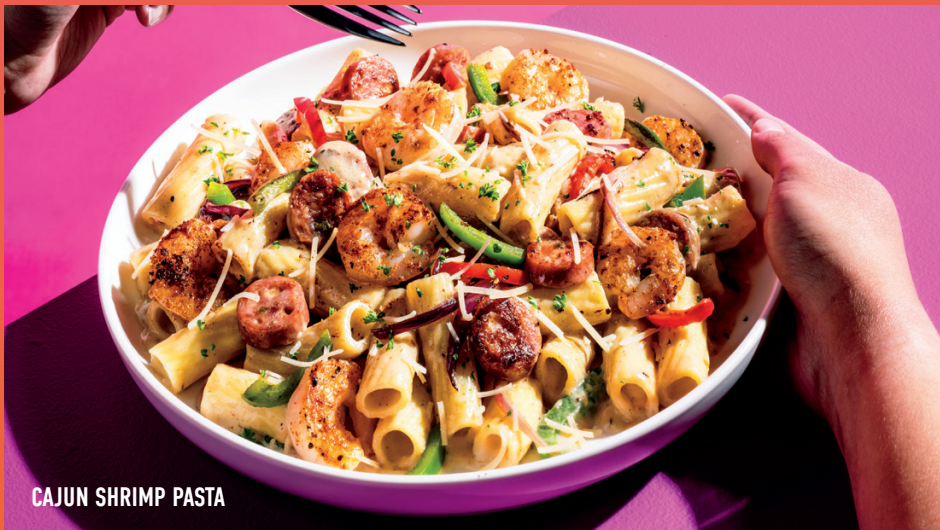
CAJUN SHRIMP PASTA

A suggested gratuity of 20% will be included on all guest checks for parties 7 or more. | *NOTICE: THESE ITEMS ARE COOKED TO ORDER AND MAY BE SERVED RAW OR UNDERCOOKED. CONSUMING RAW OR UNDERCOOKED MEATS, POULTRY, FISH/SHELLFISH OR EGGS MAY INCREASE YOUR RISK OF FOODBORNE ILLNESS, ESPECIALLY IF YOU HAVE CERTAIN MEDICAL CONDITIONS. BEFORE PLACING YOUR ORDER, PLEASE INFORM YOUR SERVER IF A PERSON IN YOUR PARTY HAS A FOOD ALLERGY. | The ingredients declared in this menu are based on information we receive from our suppliers. However, there may be variations due to ingredient substitutions that are not reflected on this menu. Regular menu items may be produced in common manufacturing facilities that do produce products with peanuts, tree nuts, fish, shellfish, and gluten. Please advise your server if you or a person in your party has a food allergy before placing your order. TO VIEW OUR FULL ALLERGY MENU, VISIT daveandbusters.com/menus/allergy . | SODIUM WARNING - Sodium content higher than daily recommended limit (2,300 mg). High sodium intake can increase blood pressure and risk of heart disease and stroke. Some items served at this establishment may contain imported seafood. Ask for more information.