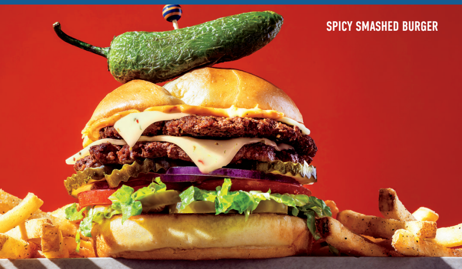
SPICY SMASHED BURGER

Bunless, on a bed of lettuce (no cost) // Sub gluten-free bun +$2.49 Sub black bean burger +$2.99 170 CALS // Add applewood smoked bacon +$1.99 90 CALS Add egg* to any burger +$1.49 90 CALS