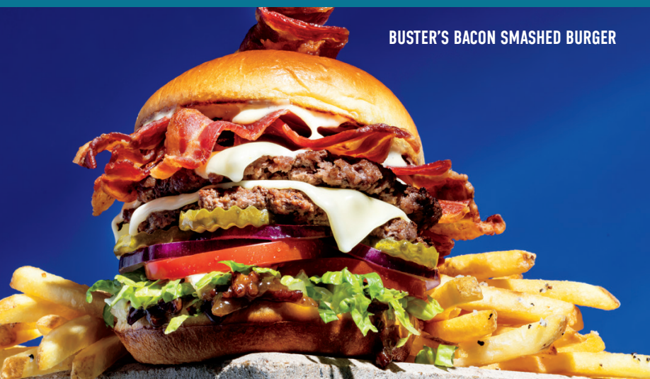
BUSTER'S BACON SMASHED BURGER

Add a bit of spice with ... Cajun-spiced patties crowned with pickled jalapeños, pepperjack cheese, lettuce, tomato, onion, pickles, jalapeño ranch & fried jalapeño on a toasted potato bun. $15.99 1250 CALS.