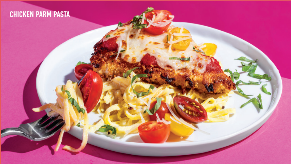
CHICKEN PARM PASTA