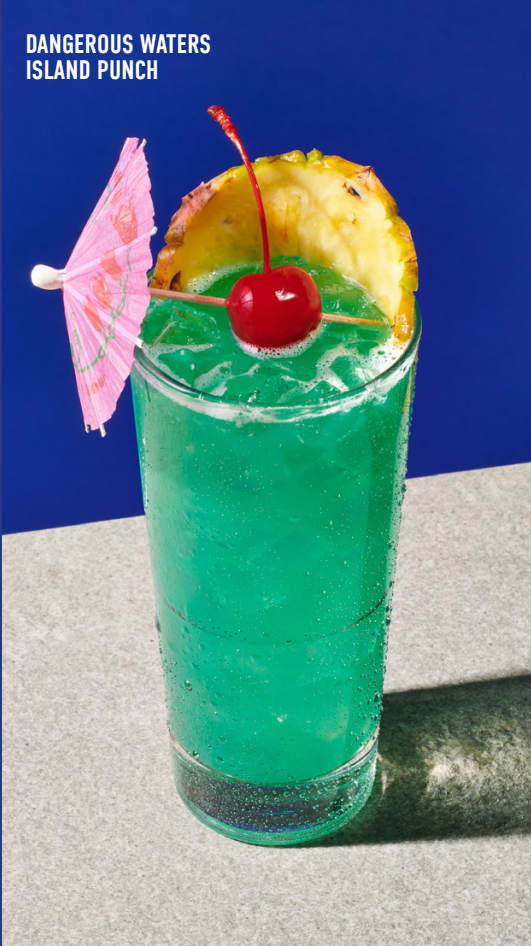
DANGEROUS WATERS ISLAND PUNCH ⚡ Malibu Coconut Rum, Blue Curaçao, pineapple juice & fresh citrus mix. 190 CALS.