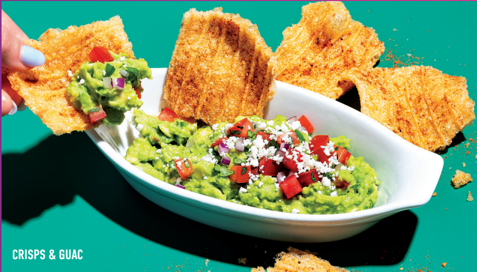
CRISPS & GUAC

A suggested gratuity of 20% will be included on all guest checks for parties 7 or more. | *NOTICE: THESE ITEMS ARE COOKED TO ORDER AND MAY BE SERVED RAW OR UNDERCOOKED. CONSUMING RAW OR UNDERCOOKED MEATS, POULTRY, FISH/SHELLFISH OR EGGS MAY INCREASE YOUR RISK OF FOODBORNE ILLNESS, ESPECIALLY IF YOU HAVE CERTAIN MEDICAL CONDITIONS. BEFORE PLACING YOUR ORDER, PLEASE INFORM YOUR SERVER IF A PERSON IN YOUR PARTY HAS A FOOD ALLERGY. | The ingredients declared in this menu are based on information we receive from our suppliers. However, there may be variations due to ingredient substitutions that are not reflected on this menu. Regular menu items may be produced in common manufacturing facilities that do produce products with peanuts, tree nuts, fish, shellfish, and gluten. Please advise your server if you or a person in your party has a food allergy before placing your order. TO VIEW OUR FULL ALLERGY MENU, VISIT daveandbusters.com/menus/allergy . | SODIUM WARNING - Sodium content higher than daily recommended limit (2,300 mg). High sodium intake can increase blood pressure and risk of heart disease and stroke. Some items served at this establishment may contain imported seafood. Ask for more information.