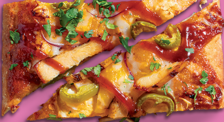
BBQ CHICKEN FLATBREAD