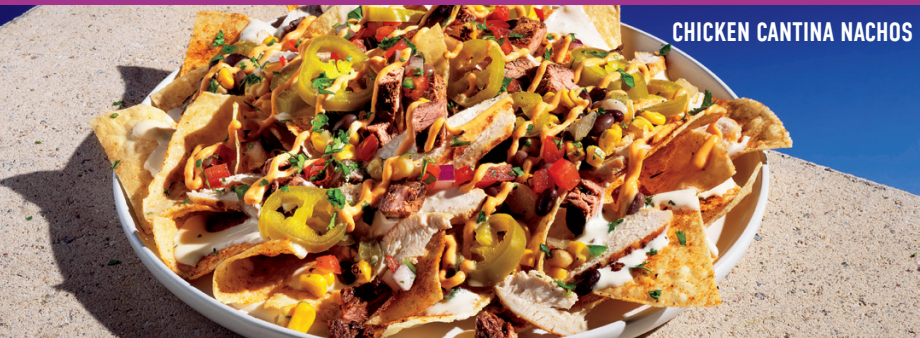
CHICKEN CANTINA NACHOS