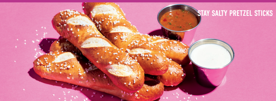
STAY SALTY PRETZEL STICKS