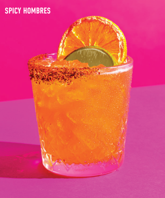
SPICY HOMBRES ⚡ Espolón Blanco Tequila, triple sec, fresh citrus mix, watermelon & strawberry. 230 CALS.