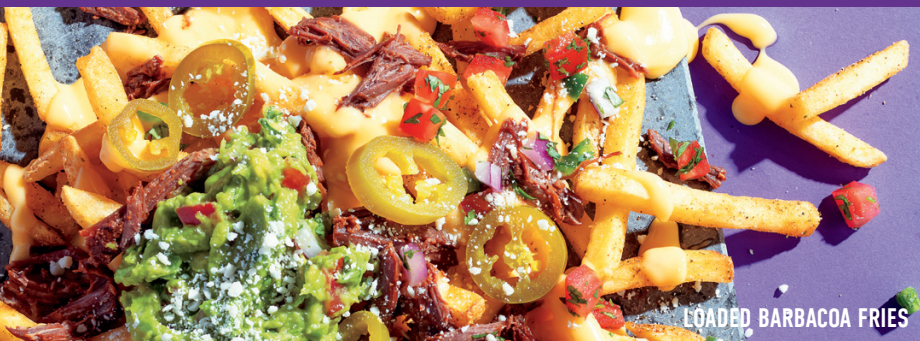
LOADED BARBACOA FRIES