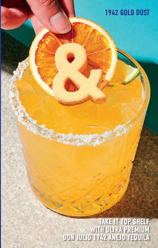
1942 GOLD DUST Ultra Premium Don Julio 1942 Anejo Tequila, Grand Marnier, Tuaca, fresh citrus mix & gold glitter bomb. 240 CALS.