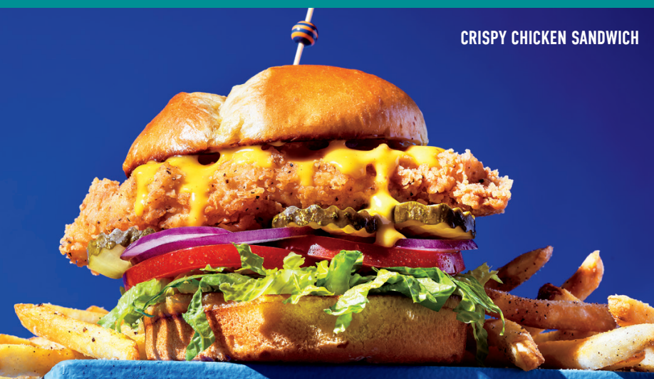
CRISPY CHICKEN SANDWICH

Pickle-brined crispy chicken, lettuce, tomato, onion, pickles & mango honey mustard on a toasted potato bun. $14.99 1060 CALS.