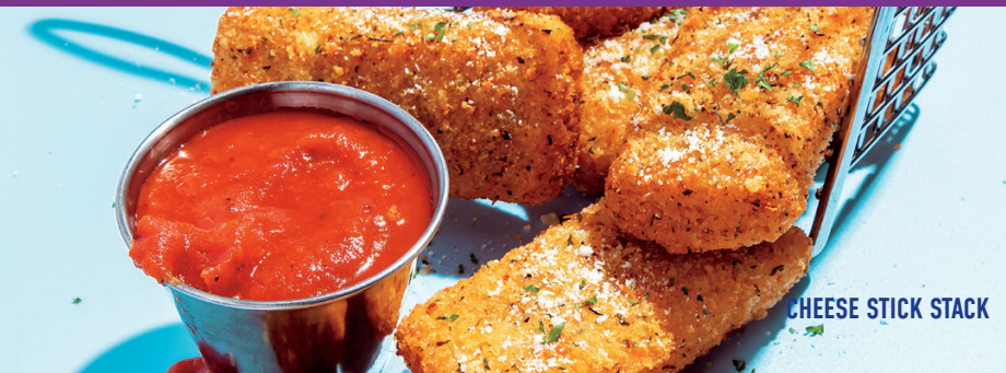
CHEESE STICK STACK