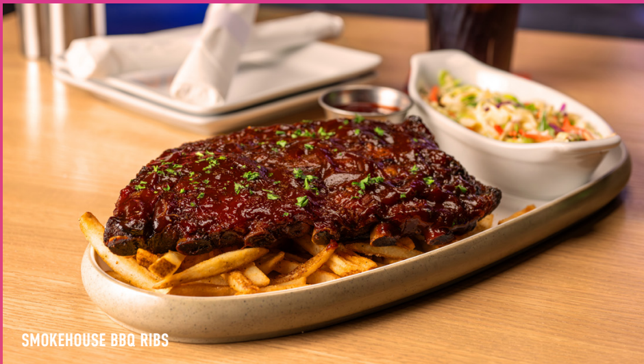
SMOKEHOUSE BBQ RIBS

Hand-breading hits different. Served with seasoned fries, coleslaw & a side of mango honey mustard. $12.99 1210 CALS.