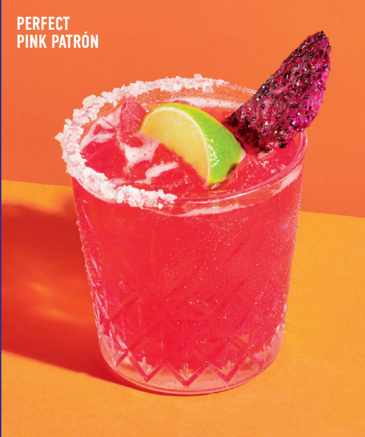
NEW! PERFECT PINK PATRÓN ⚡ Milagro Reposado Tequila, Grand Marnier, fresh citrus mix, garnished with lime, dried orange & a salt rim. 170 CALS.