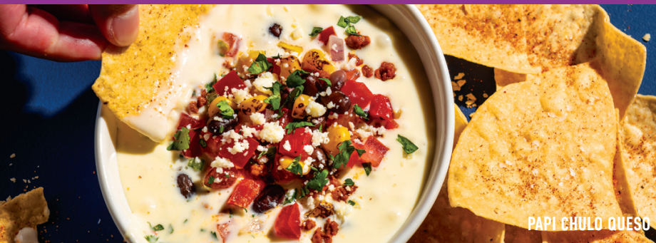
PAPI CHULO QUESO