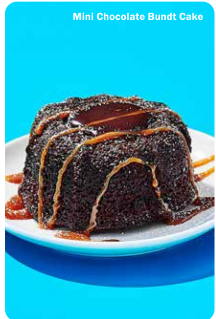
Mini Chocolate Bundt Cake

GF Gluten Friendly V Vegetarian VE Vegan